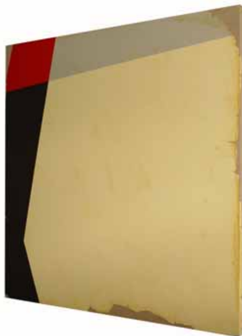
Above: Chris Bond Abstract Remnant 0404.1, 2004 Oil on linen 76 cm x 76 cm Image courtesy of the artist

Even in the most recent works, Bond still combines the metaphysical with ideas gleaned from 'paranoiac' thought processes. This brings us to question the possibility of art as a construct that simply exists as a figment of a person's imagination. In viewing these contrasts between positives and negatives we also realize that Bond's works are not as